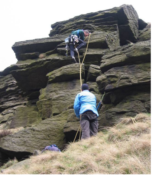
Paul Durkin, first ascent, Shield, VS