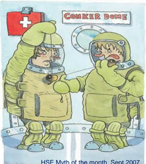
HSE Myth of the month, Sept 2007